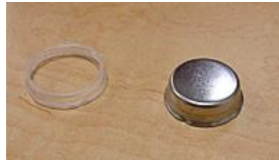
w/ MOLD B

Size: 200W x 200H x 180D mm Weight: Approx. 6kg Coin Cell: 2016 or 2025 or 2032 (one size only per tool)