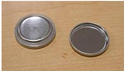
w/ MOLD A